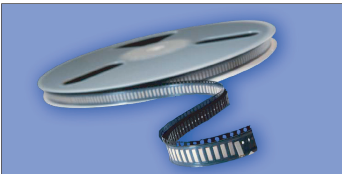
Figure 4: Typical Reel of GORE® SMT EMI Gaskets and Grounding Pads

Gore uses reels that have 330-mm plastic flanges with 100-mm inside diameter cores and 330-mm outside diameter cores (Figure 4). The inside diameter has three sprocket notches with a minimum diameter of 20.2 mm. The reels are labeled on one side with the part number, the lot number, the date, and the number of parts on the reel. Reels are packaged into cartons; the number of reels per carton varies depending on tape width (Table 2).